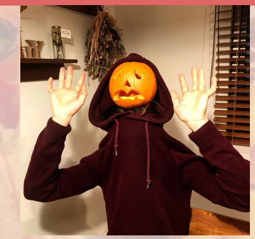
Happy Halloween Shiga! Thank you for not flipping any cars.